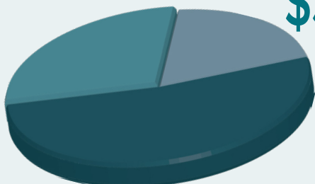
53% Full Time Employees, including DCMs 27% Management, Rent, IT, Conference Travel, Fundraising 20% Direct Costs for Repairs & Rehousing

$330,660 total capacity spending* in 2025