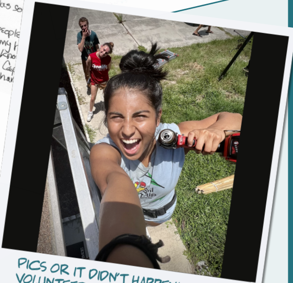
PICS OR IT DIDN'T HAPPEN! GPIA VOLUNTEERS TAKE A MINUTE OUT OF REPAIRING A ROOF TO SNAP A SELFIE. LOL.