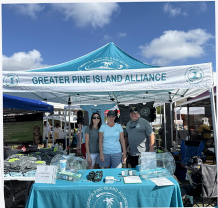
Attending local events helps us connect with islanders in need – and those who can help!

Lowe's frequently donates building materials and other goods that GPIA uses to help Pine Islanders rebuild.